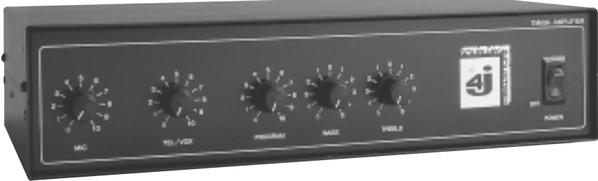
MODEL AXTM25A 25 WATT AMPLIFIER MODEL AXTM60A 60 WATT AMPLIFIER