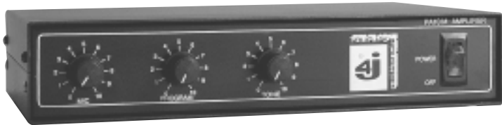
MODEL AXPA10M 10 WATT AMPLIFIER