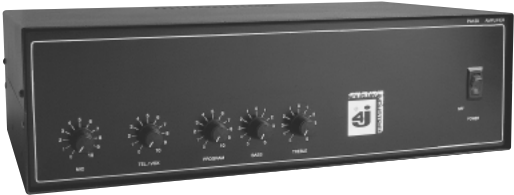
MODEL AXTM120A 120 WATT AMPLIFIER