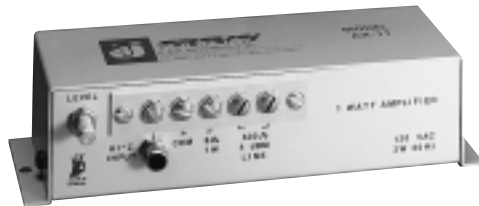
MODEL AX-11 1 WATT AMPLIFIER